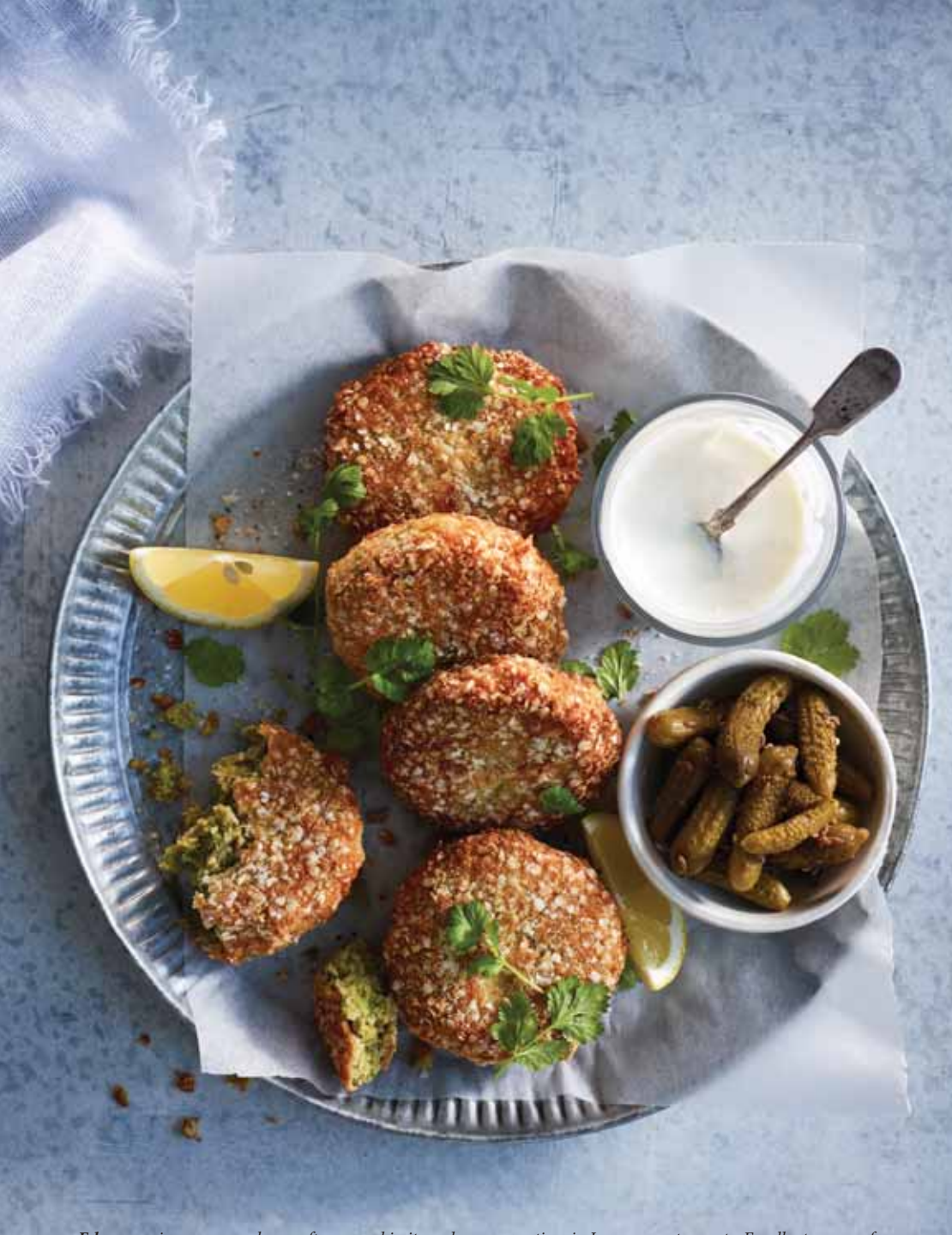
Edamame is a young soybean, often served in its pod as an appetizer in Japanese restaurants. Excellent source of protein, dietary fibre and a good source of folate and minerals like iron, calcium and magnesium. Also a source of isoflavones, linked to bone health.